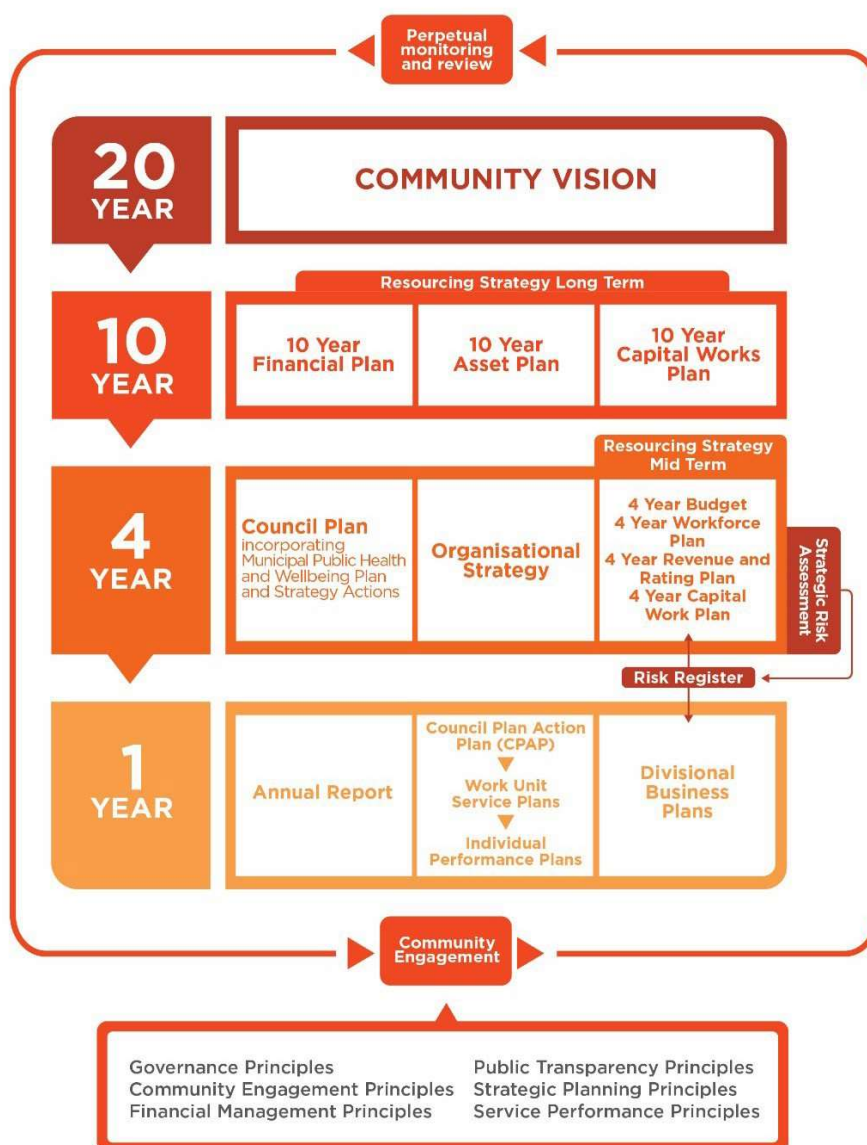
Diagram 1 – Council's Integrated Planning and Reporting Framework

This plan explains how Council calculates the revenue needed to fund its activities, and how the funding burden will be apportioned between ratepayers and other users of Council facilities and services.