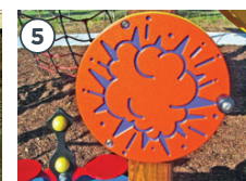
Spinning roasters for interactive play