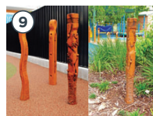
Touchwood totems for sensory play