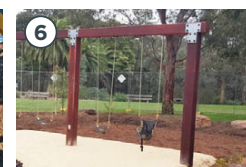
Swings with high back harness and junior seat