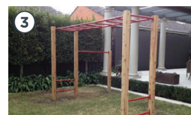
Monkey bars for agility and body strengthening.