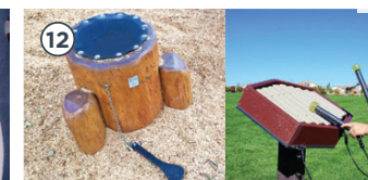
Jungle drums & marimba for creative musical play