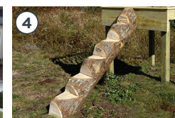
Adventure climbing clamber log