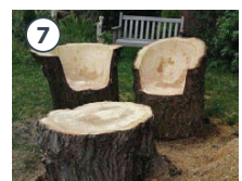
Log throne seats for imaginative play