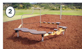
Mini trail balance challenge for coordination and agility