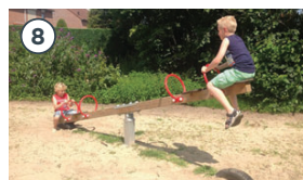
See-saw for coordination with upto four friends