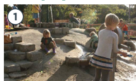
Natural adventure rock climbing play