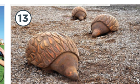
Artistic animal sculptures for discovery sensory play