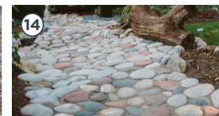
Stone feature to encourage tactile play rock stacking

Images shown are indicative and installed equipment may differ slightly in appearance.