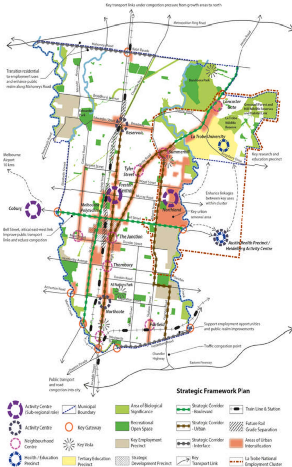
Figure 2: Darebin Strategic Framework Plan