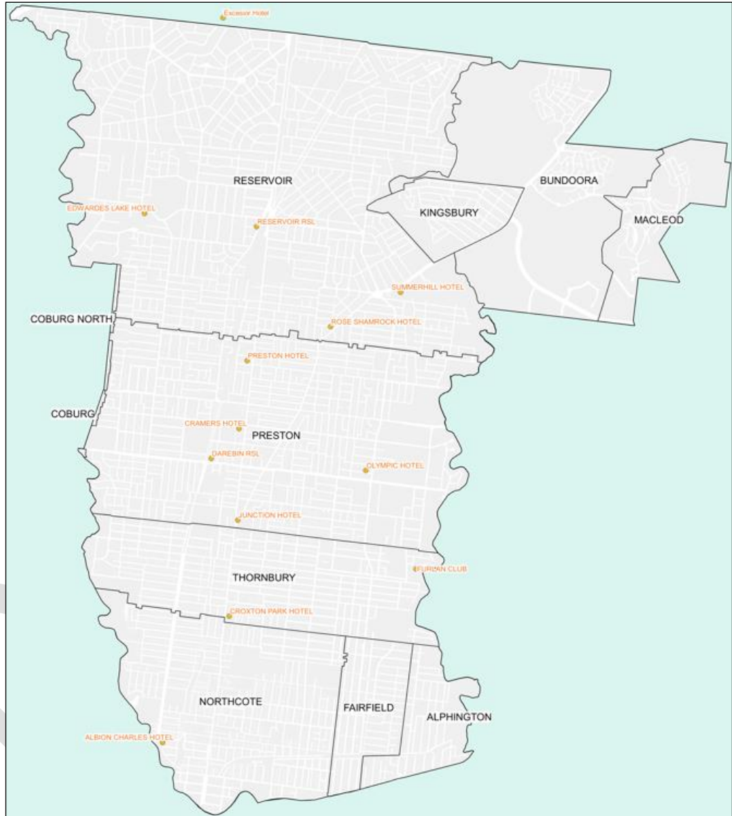
Figure 2: Spatial distribution of EGMs venues in Darebin

were 743 pokie machines in 12 venues in the city of Darebin, which is 97% of the legal limit. 3 Figure 2 shows spatial distribution of EGMs venues in Darebin.