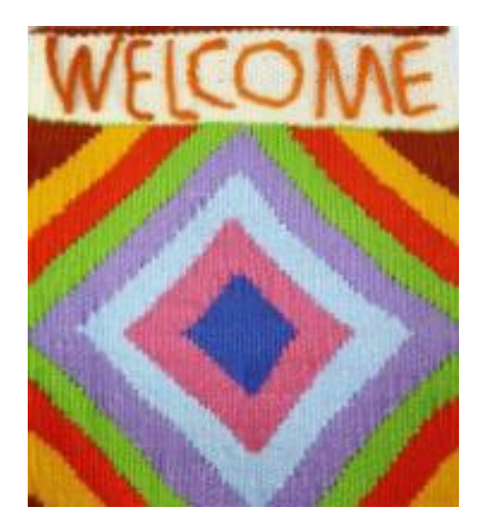
Credit: 350 High Street, Preston, entrance of future Intercultural Centre. Photographed by Michael Findlay

analyse intercultural experiences critically. It offers opportunities for one to consider one's own beliefs and attitudes in a new light, and so gain insight into oneself and others<sup>9</sup>.