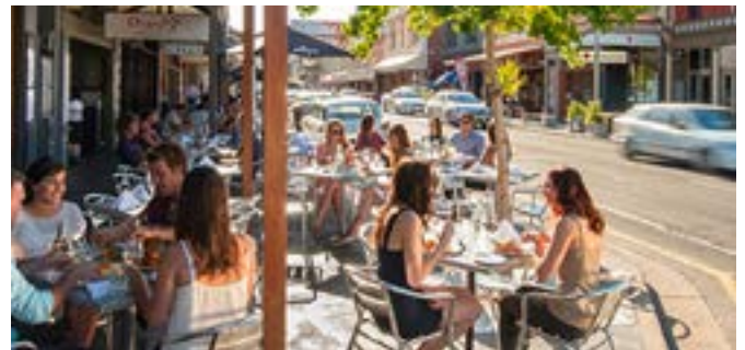
Ensure that opportunities for small businesses, cultural traders and start ups have space in Future Preston

Ensure that the night time shopping and dining experience is welcoming and safe for the people.