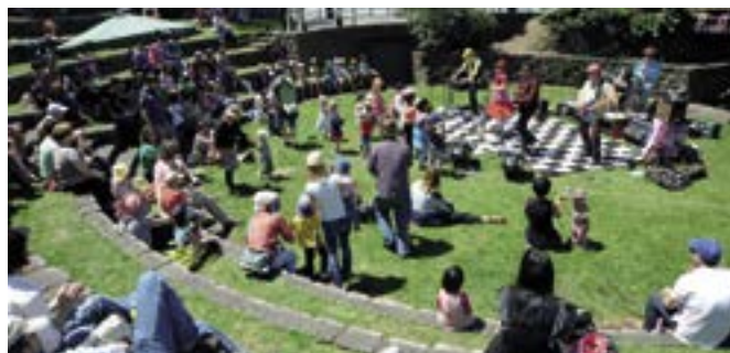
Community events and places to gather increase connectivity and inclusiveness

Support and provide opportunities for diverse community groups to engage in public life.