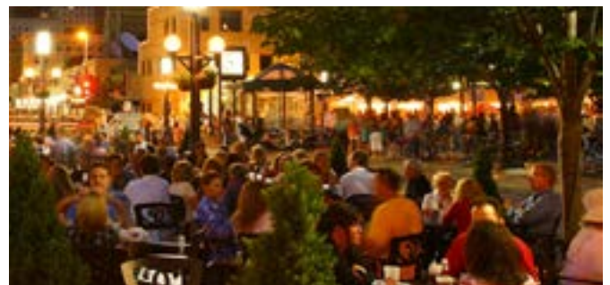
Night time economy improvement increase safety and accessibility