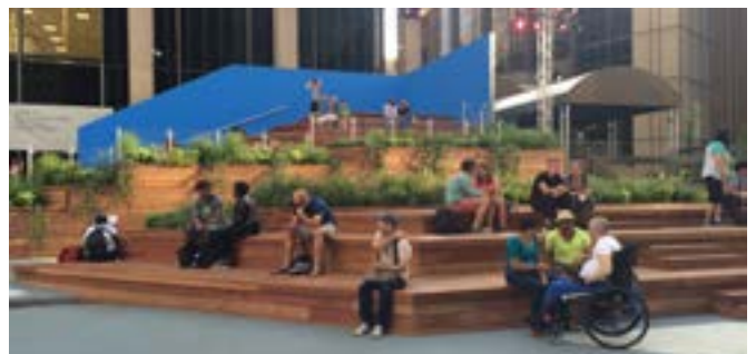
Provide the facilities that make an open shared space more comfortable to stay longer