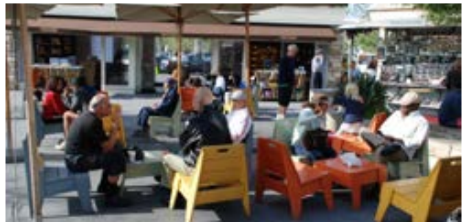
Creating a welcome open space that usable for all ages, and backgrounds

Improve the physical comfort and convenience of public places to encourage longer stays by providing wind and rain shelter, well-placed comfortable seating for eating and resting, and facilities such as water bubblers. Provide a mix of permanent and mobile seating to suit different user requirements.