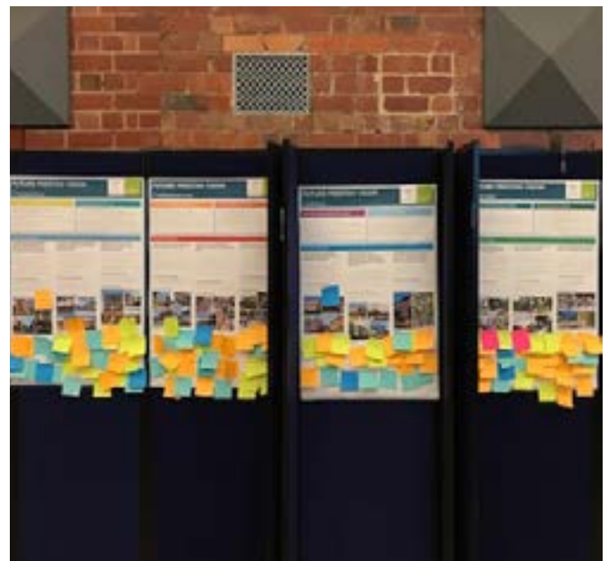
Future Preston Summit - Discussion Starters activity