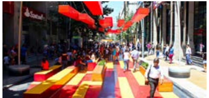
Streets can be designed for short or longer term closures