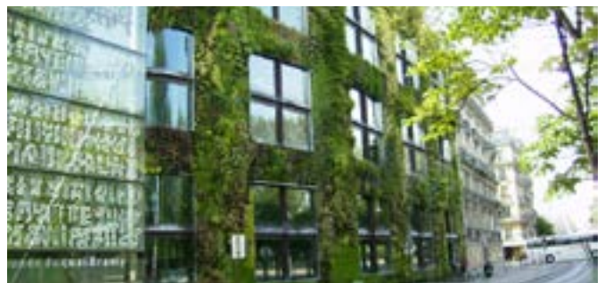
Integrate green feature walls where open space isn't possible