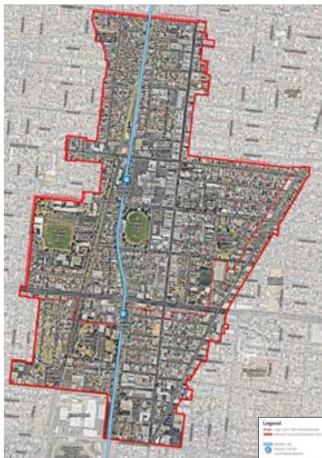
From top to bottom: Future Preston logo, Map of the Central Preston Structure Plan area