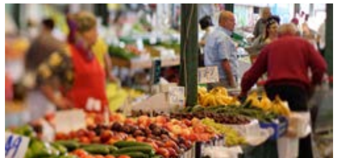
Supporting a diversity of businesses sizes supports economic accessibility and business diversity