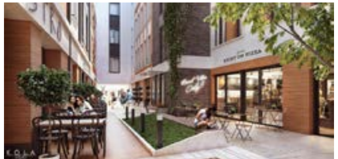
Human scaled spaces integrating detailed and active engaging shop fronts

Support increased housing numbers and variety but within a lower scale, European-style development approach and are sensitive to the heritage fabric in terms of scale.