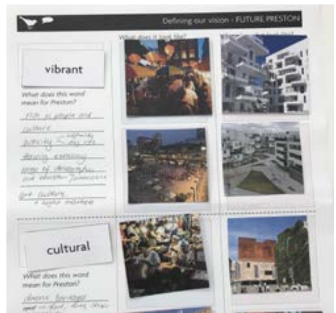
Community and stakeholders workshop - Image play