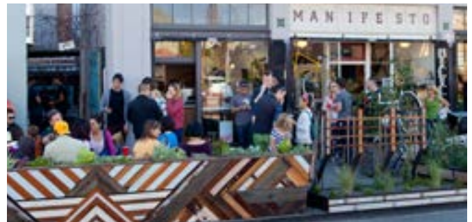
Smaller lot sizes and diversity of design and housing options will support more diverse people being able to live, work and visit

Ensure that Preston's diversity of people, culture, activity, shops and food is retained and expanded on through Council programs and the planning controls guiding newer developments.