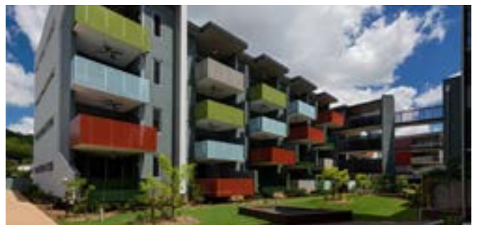
The community does not want bland and repetitive designs but buildings that express the diversity of the community