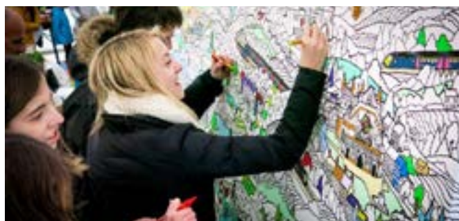
Supporting local art enhance the local identity and economy