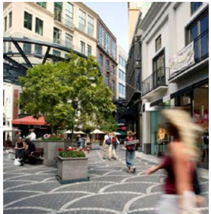
New buildings should deliver quality and respectful design and materials and integrate landscape

Support and encourage the narrow shop fronts and culturally diverse retail mix for its unique contribution to Preston's identity and culture and the opportunity it presents to a range of entrepreneurs from all backgrounds.