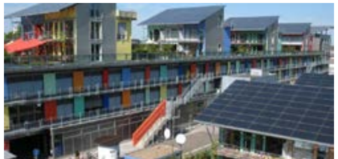
Ensure new developments are designed to meet Green Star requirements and consider neighbourhood sustainability/ resource management