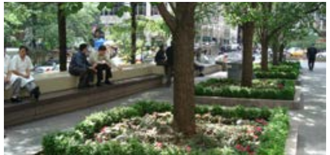
Vegetation makes the street more welcoming and pleasant