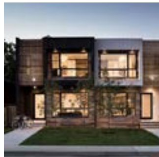
Provide a range of housing typologies that take advantage of proximity to public transport and integrate shared communal spaces

Ensure that the area has the appropriate retail, employment options, transport, open space and community facilities to support the population.