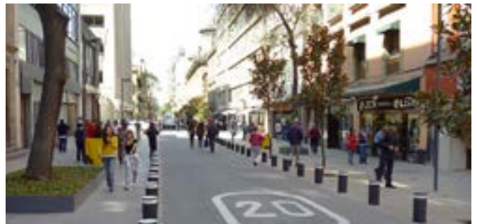
Reduce the dominance of private vehicles by reallocating space for other uses

Support and encourage sustainable modes of transport e.g. active paths - walking and cycling- and public transport. Encourage investment into public transport and active travel modes that could improve sustainability and change the way in which the car-dependant Preston moves in the future.