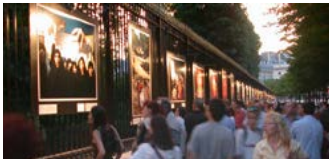
Street festivals do not require an indoor massive space