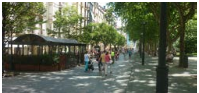
Places close to the station should be car free