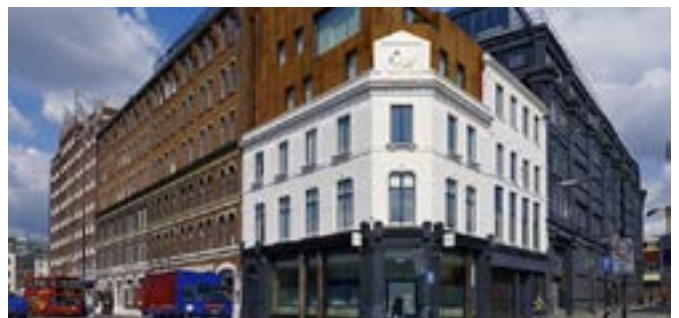
Integrate existing layers of history and traditional street edges with smaller development footprints to maintain diversity of built form, design and ownership